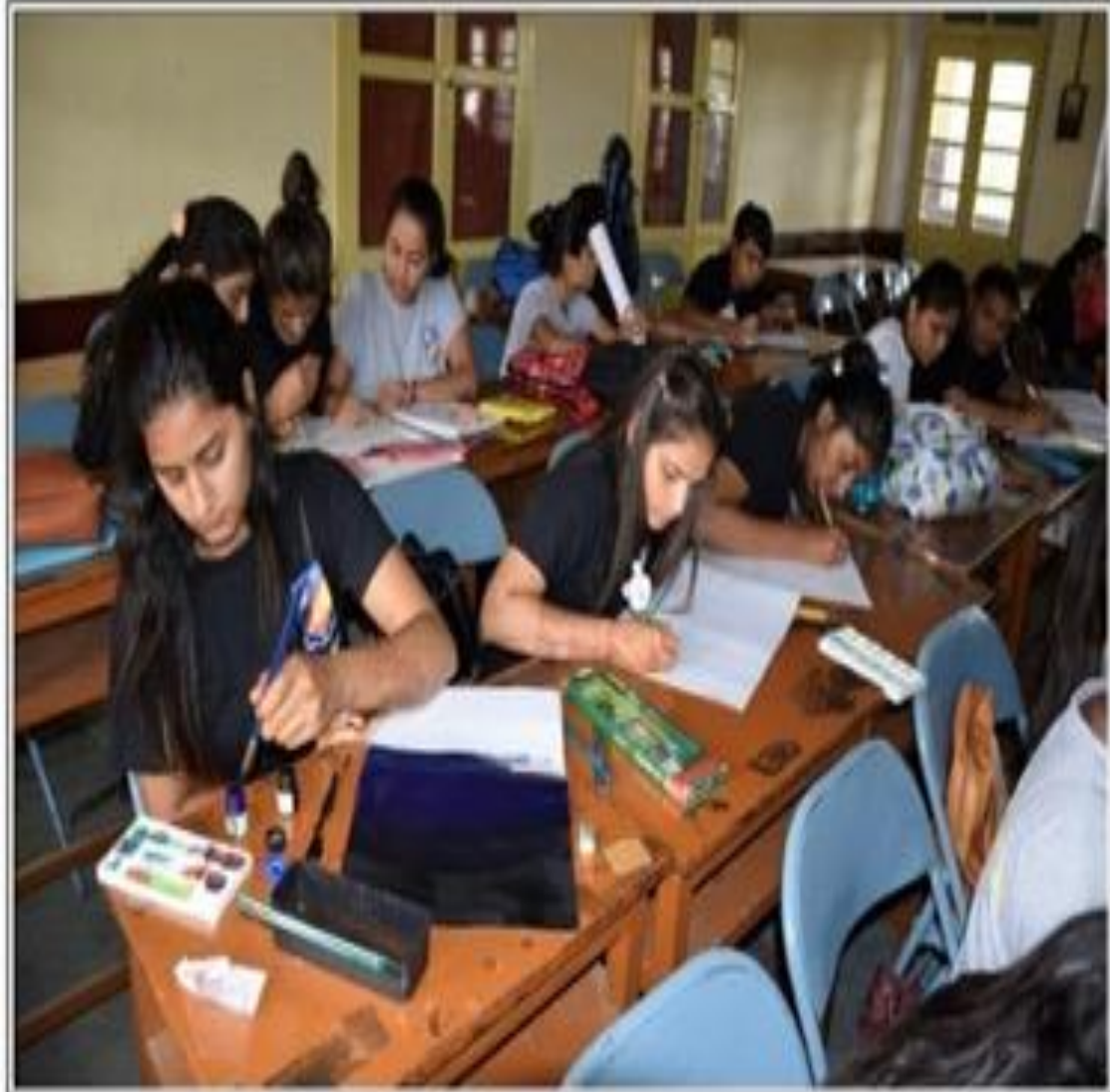
6 th Sept 2019 Poster making competition- theme- environmental issues