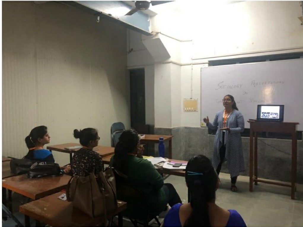
PPT competition PG- Agrarian movements