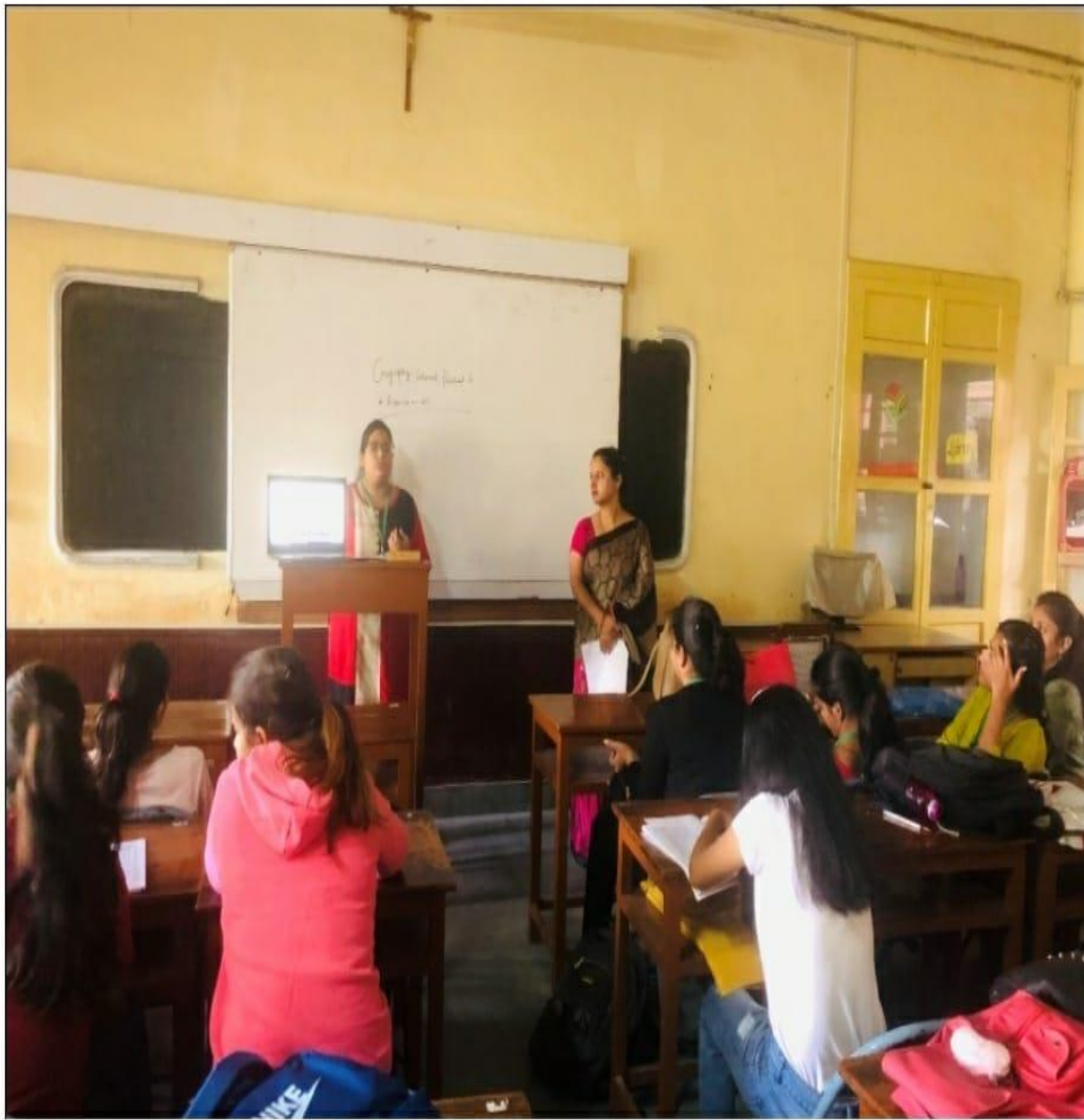
PPT competition UGs – ‘Crime’