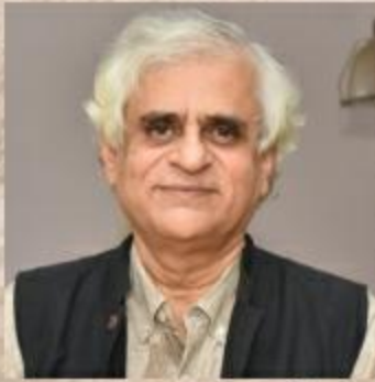
P. Sainath (Indian Columnist and Writer)

P. Sainath is an accomplished Indian columnist, Rural Reporter, and a renowned author. He is known for his extensive writing on rural India, particularly focusing on poverty, structural inequities, caste discrimination, and farmers' protests. Sainath has received numerous prestigious awards, including the Ramon Magsaysay Award and holds over 40 global and national awards for his reporting. He was the first reporter to win Amnesty International's Global Human Rights Journalism Prize in 2000. In 2014, he founded the People's Archive of Rural India (PARI), an online platform addressing social and economic inequality, rural affairs, poverty, and the impact of globalization in India. He is also widely respected as the Father of Rural Journalism.